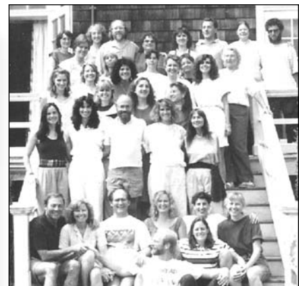
Bridgehampton, Long Island...1989!